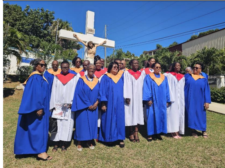
Patronal Feast Combined Choir December 28, 2025