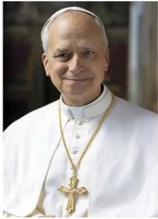
Leo P.P. XIV