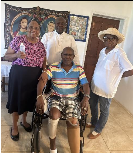
Pastoral care of the sick

This commandment is considered a liberation, allowing man not to be a slave to work.