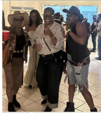
Country & Western Dance Night