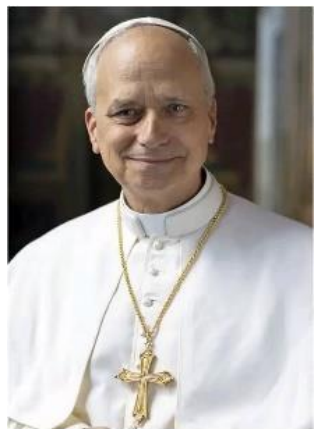
Leo P.P. XIV