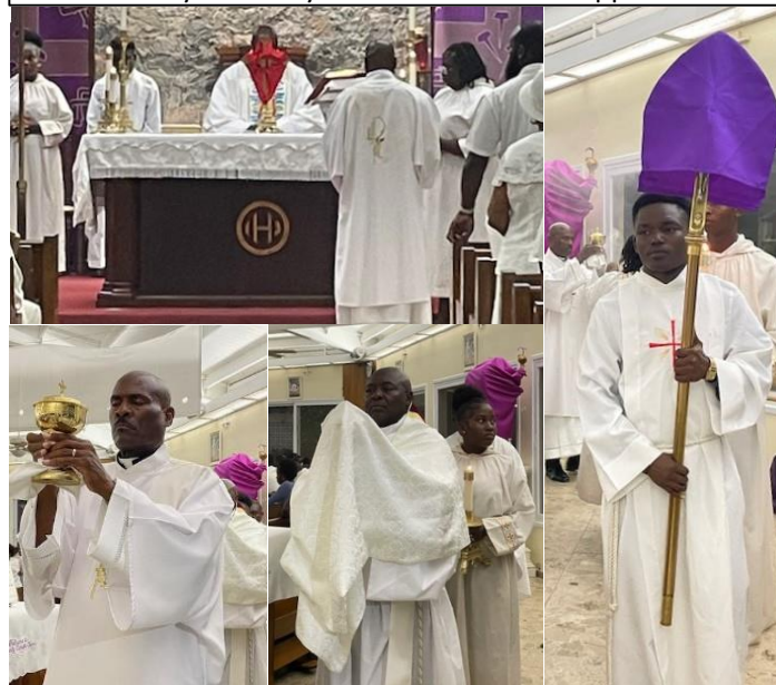
Holy Thursday Mass of the Lord's Supper