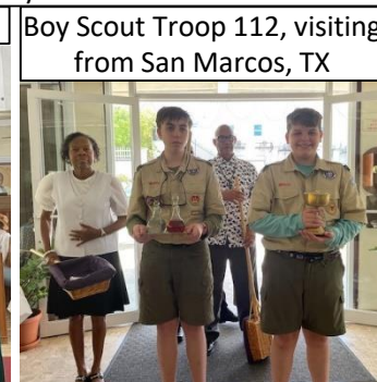
Boy Scout Troop 112, visiting from San Marcos, TX