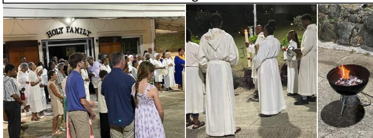
Easter Sunday Mass